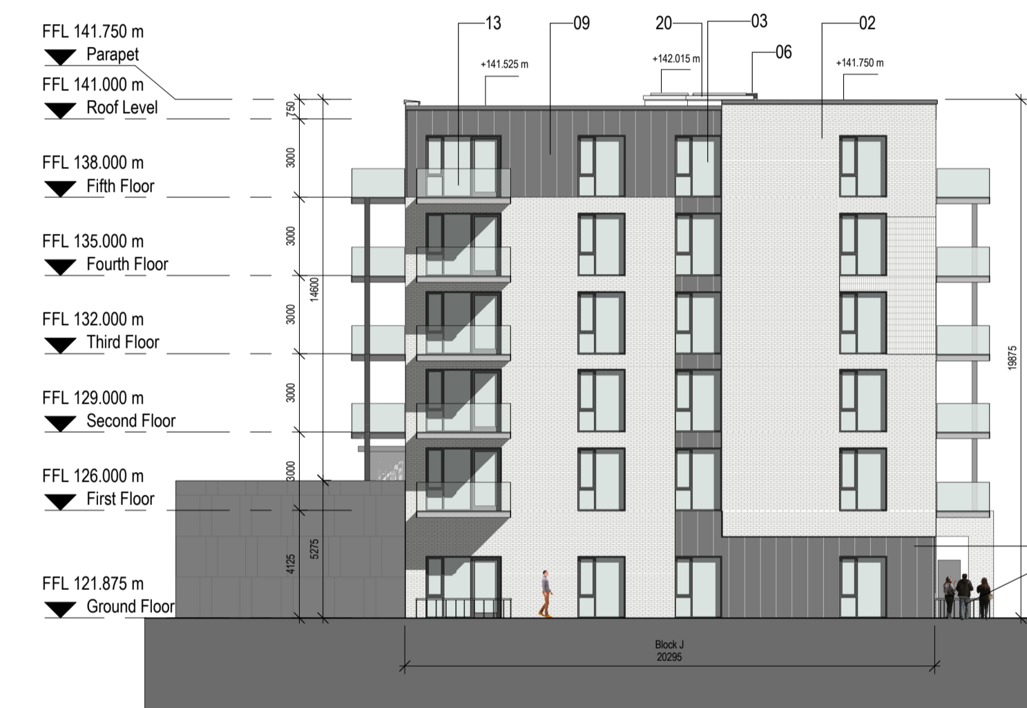
04 - Proposed South Elevation - Block J 1 : 200