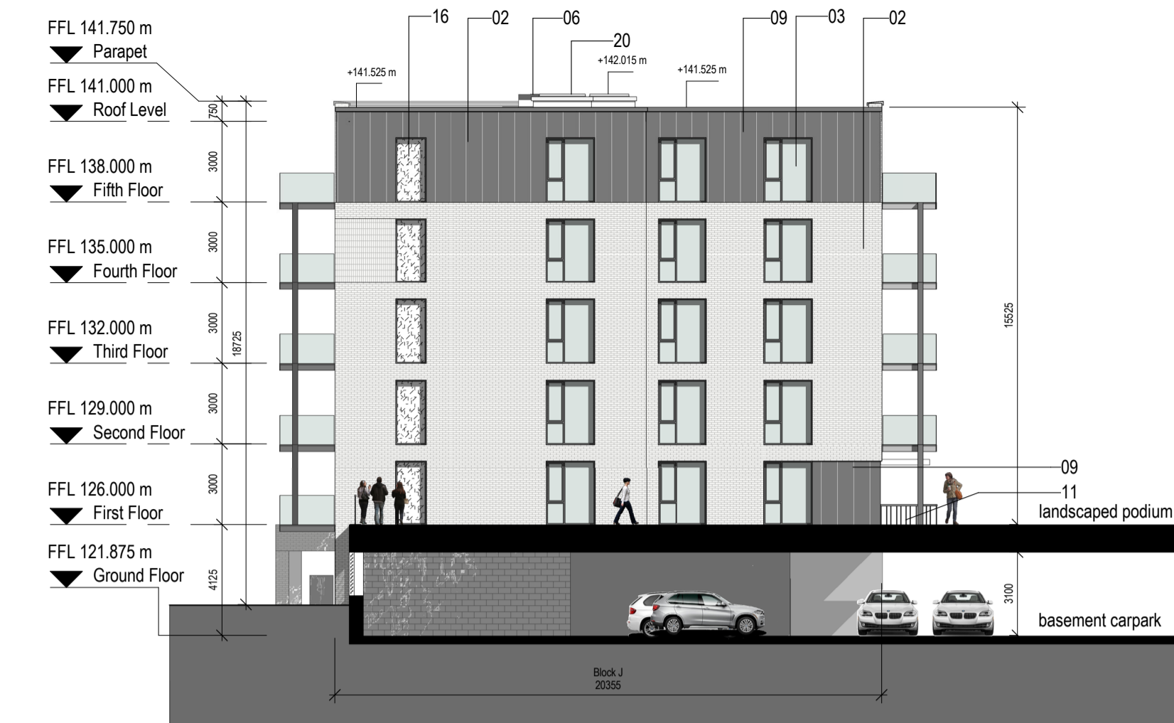
02 - Proposed North Elevation - Block J 1 : 200