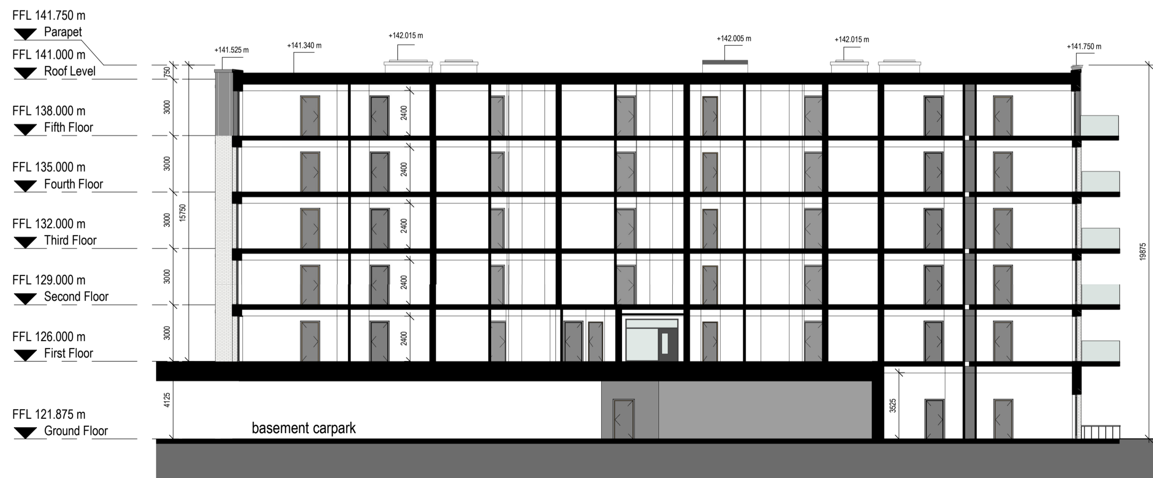
Section A-A 1 : 200