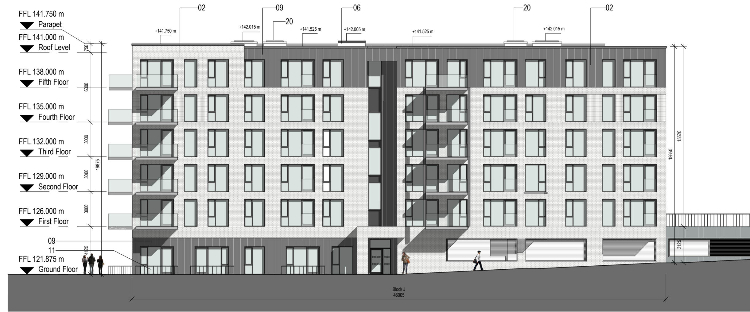
01 - Proposed East Elevation - Block J 1 : 200

ALL DIMENSIONS ARE TO BE CONFIRMED ON SITE DIMENSIONS ARE NOT TO BE SCALED FROM THIS DRAWING THIS DRAWING IS TO BE READ IN CONJUNCTION WITH CONSULTANTS DRAWINGS ALL WORK TO BE CARRIED OUT IN ACCORDANCE WITH CURRENT BUILDING REGULATIONS