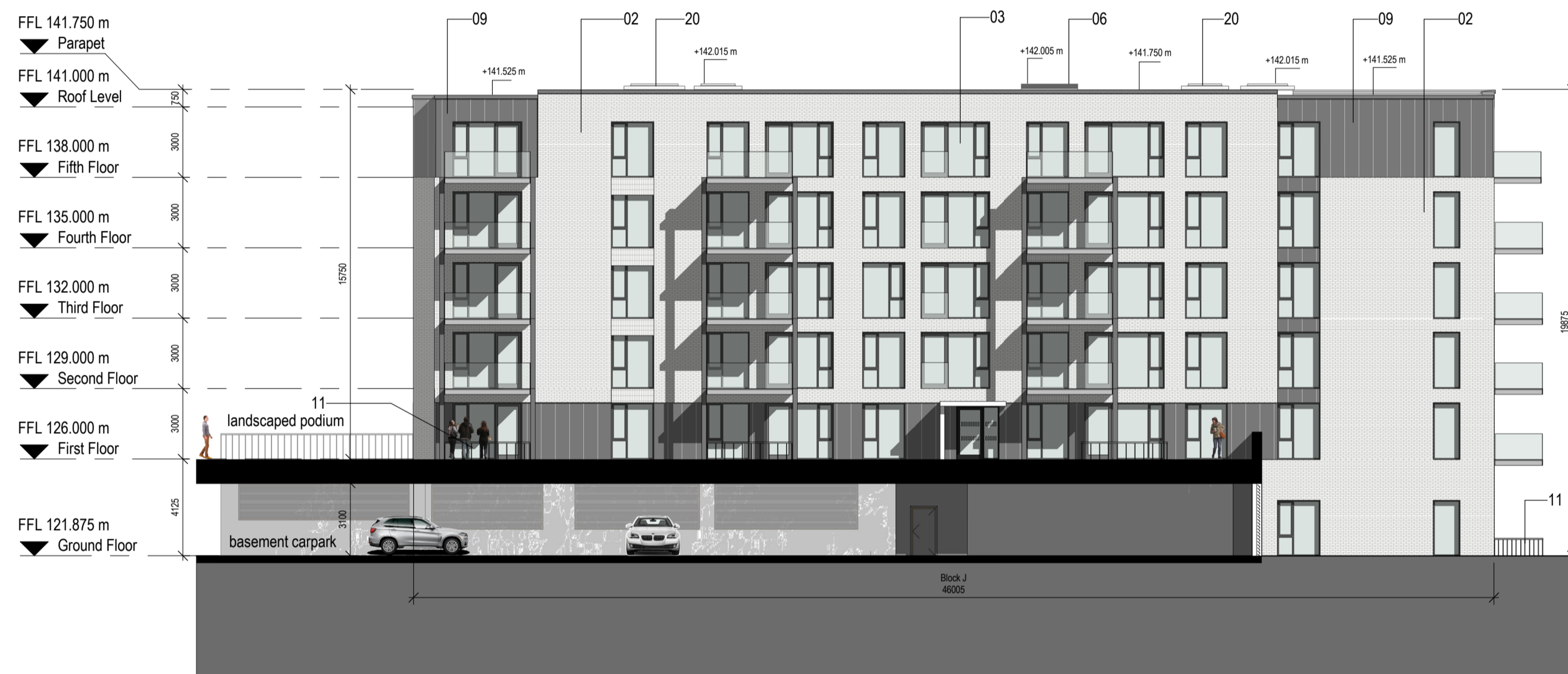
03 - Proposed West Elevation - Block J 1 : 200