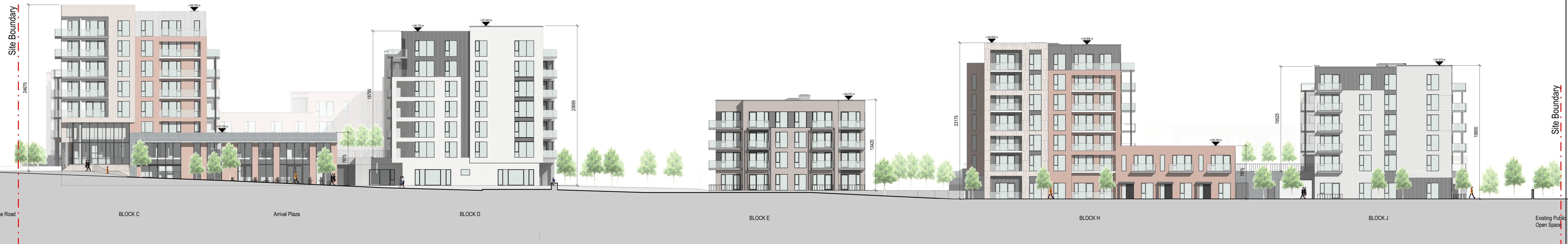
02 Elevation to Village Road 1 : 200