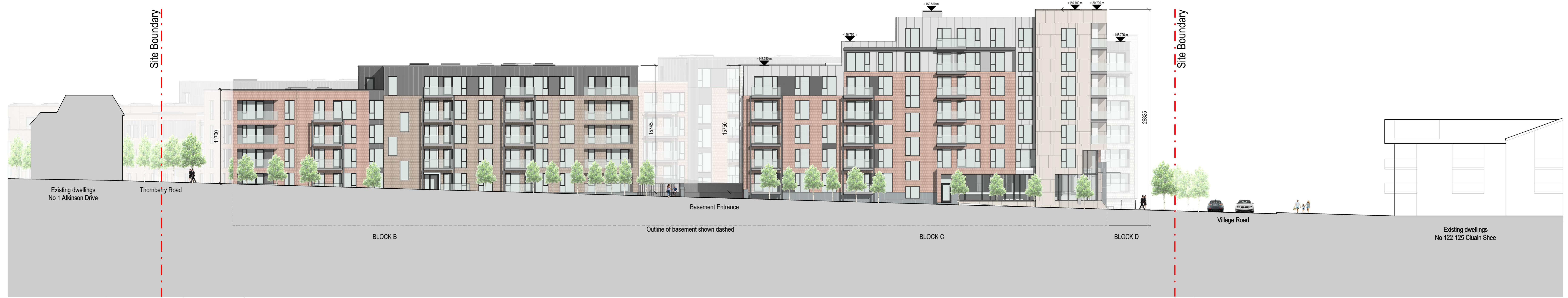
01 Elevation to Atkinson Drive 1 : 200