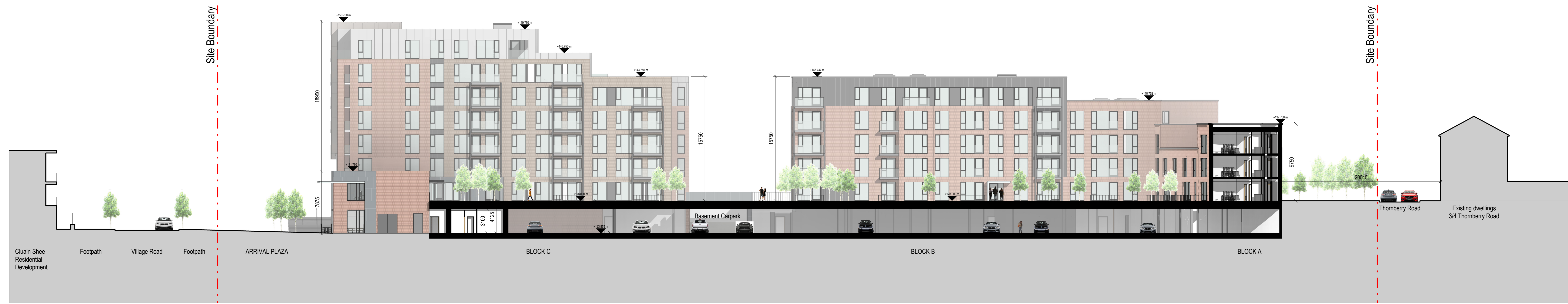
Section A-A 1:200