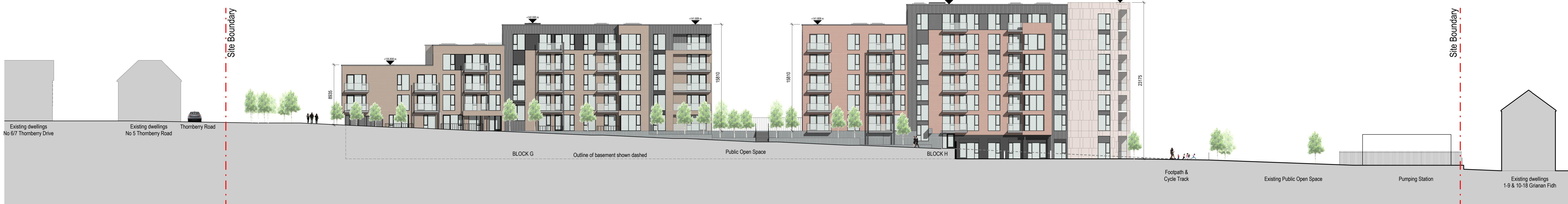
Section B-B 1:200