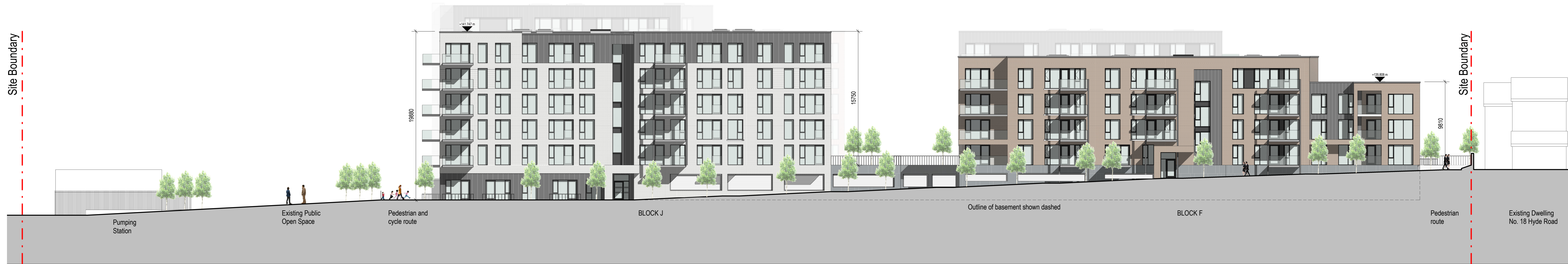
04 Elevation to Ferncarrig Avenue 1:200