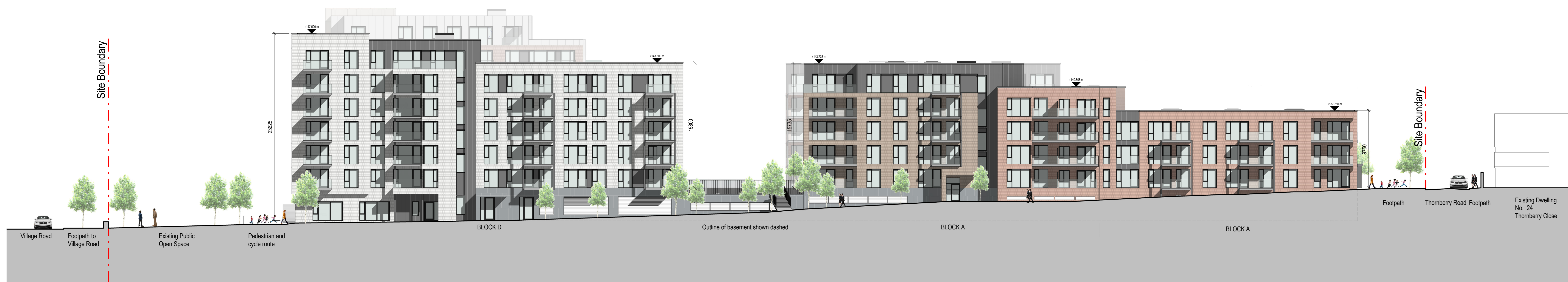
Section E-E 1:200