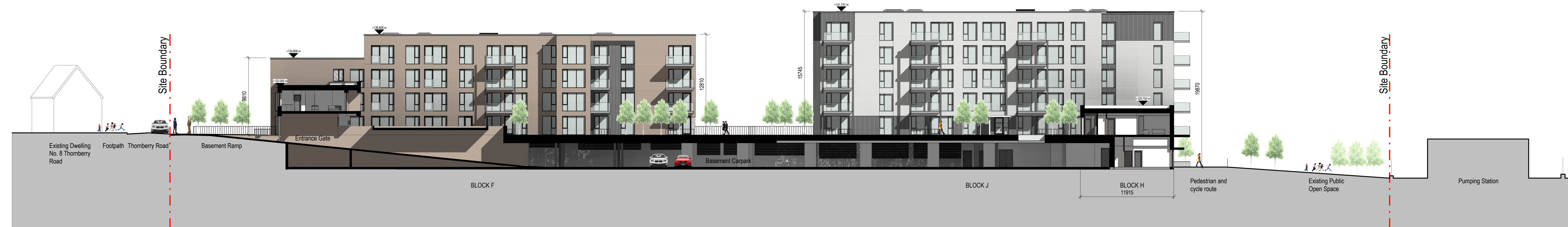
Section D-D 1:200